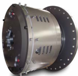
Marine Standard Ventilated Clutches