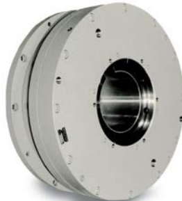
Model HBA Clutch/Brake