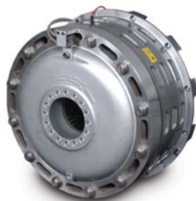
LKB Spring Set Brakes